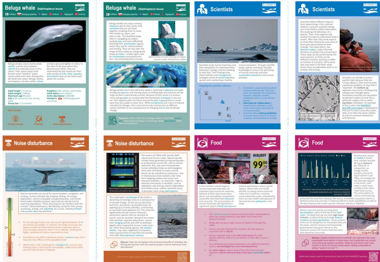
Figure 1. The GUARDNA information cards feature information on marine mammals, stakeholders, threats and uses.